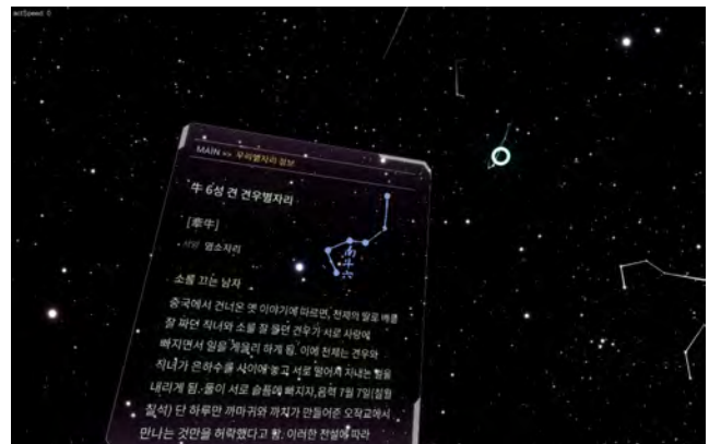
Figure 4: The selected constellation's information panel appears in world space, facing the user from a comfortable viewing distance.

The system was implemented in Unity3D and designed to work with the Oculus Consumer Version 1 VR headset and Oculus Touch controllers. The experience starts from the position of Earth and our Solar System. The left controller thumbstick controls the 3D navigation in space, and the navigation speed changes according to the degree to which the stick is pushed. Users can choose to move forward in the direction of their gaze, or set to absolute directions. The right controller's thumbstick controls the rotation of their view, and enables them to zoom in and out of our Galaxy (Figure 5).