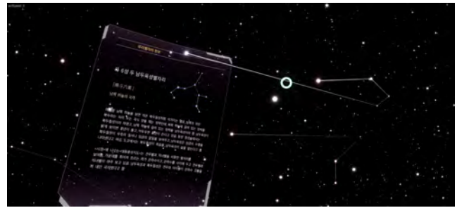
Figure 3: The Southern Dipper constellation shown is drastically different from its iconic shape from Earth displayed in the info panel.

and clicking the trigger button with the touch controller (Figure 4).