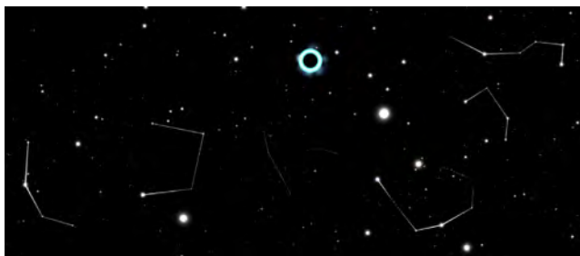
Figure 2: A view of the lunar lodges from the perspective of Earth.

The system presents an immersive data-driven experience of Korean constellations and stars in our Galaxy. 25 of the 28 su are visualized, along with a select number of important constellations inside the circle of perpetual visibility (Figure 2), which encircles an area of the sky that could be observed in all seasons. Users are free to roam anywhere in the Galaxy and view the constellations from constantly changing perspectives. Specific information on every constellation and its stars are accessible by pointing the reticle in its direction