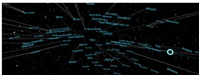
Figure 6: When the star labels are turned on, it prioritizes unique Korean names over Western ones when available. Hipparcos IDs are displayed for stars without distinct names.

Some constellations such as the Buk-du (Northern Dipper) have important constituent stars that can be individually selected for detailed information. To access this information, users must hold the trigger button and release it when the reticle is hovering over the star. Users can also fly away from our Galaxy to gain a distant view, promptly return to their starting point (Earth), and toggle star and constellation names on and off in the view settings (Figure 6).